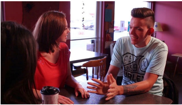
Still photo from His & Hers