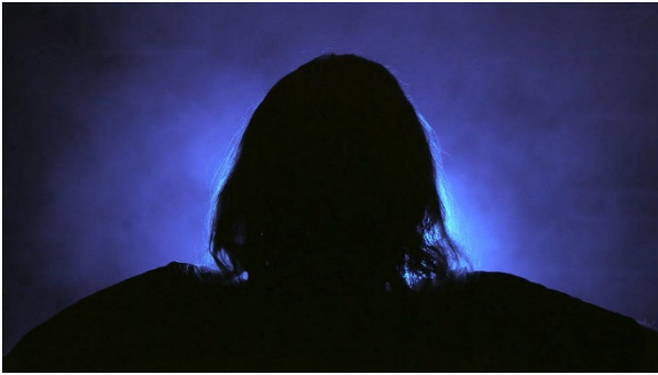
Still photo from Normie

This program ranges from delightfully creepy to major weirdness to horrifying. Stay until the end if you dare!