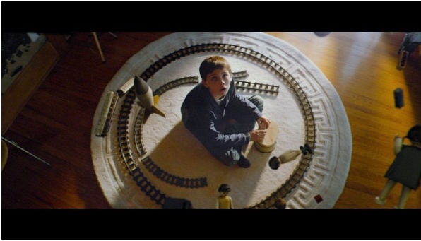
Still photo from Zero

Two shorts and a microbudget feature from an MSU student explore some what-ifs.