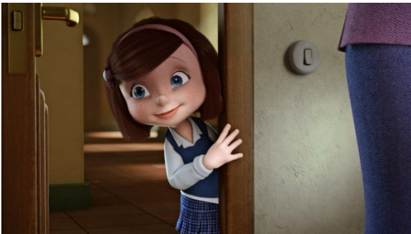
Still photo from Cuerdas

Welcome to the Festival! We're starting off with a selection of music videos and short animations from around the world. Come downtown to the Soo Theatre and help us kick off the festival!