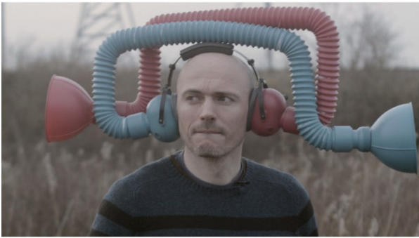
Still photo from The Reinvention of Normal

This program is a mix of short documentaries and narratives, some from far away from the Great Lakes. For this segment we were looking for beautiful cinematography and compelling or maybe just downright quirky stories. We think you'll agree we found them!